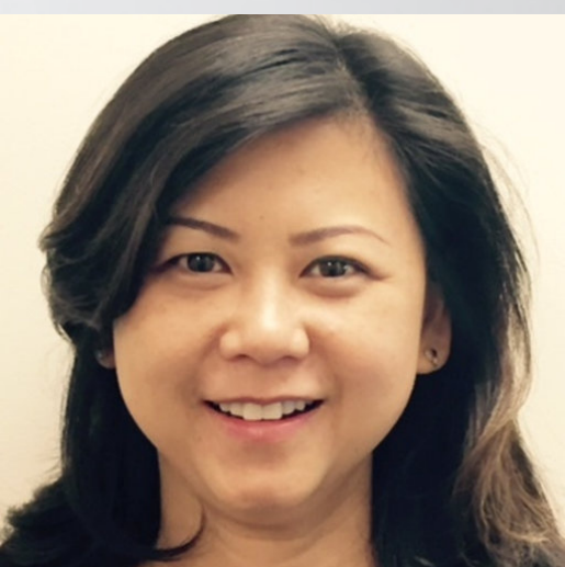
Han C. Phan Rare Disease Research LLC, USA

17:10 - 17:35 | Title: Rare diseases require unique approaches in clinical trial design