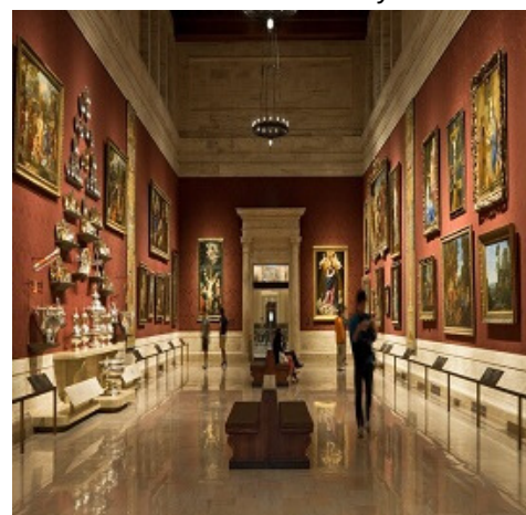
Museum of Fine Arts, Boston