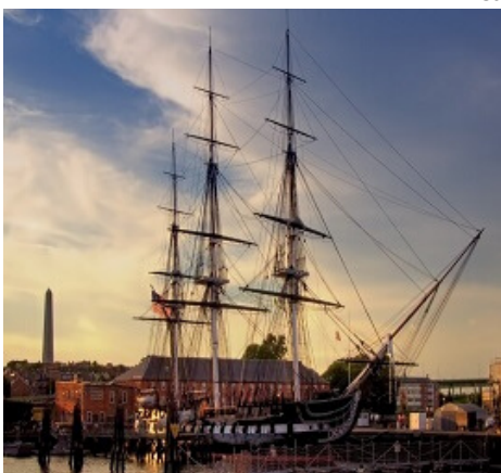
USS Constitution and Bunker Hill