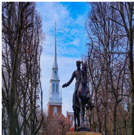
Boston Freedom Trail