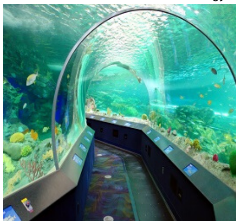
New England Aquarium