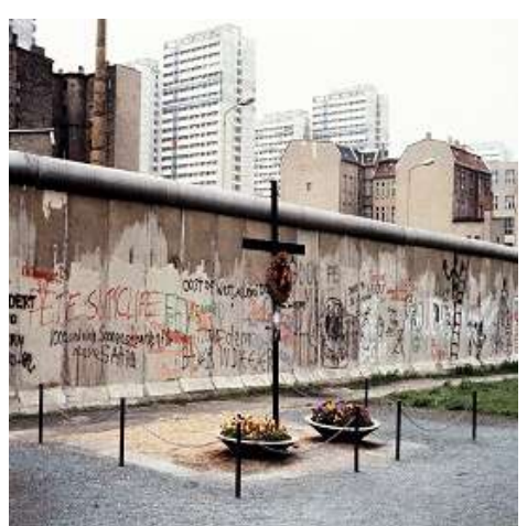
Berlin Wall Memorial