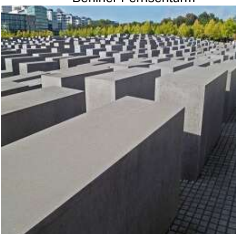
Memorial to the Murdered Jews