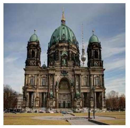
Berlin Cathedral Church