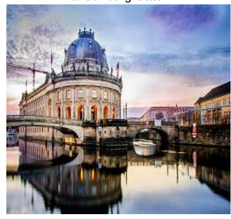
Museum Island Museum in Berlin